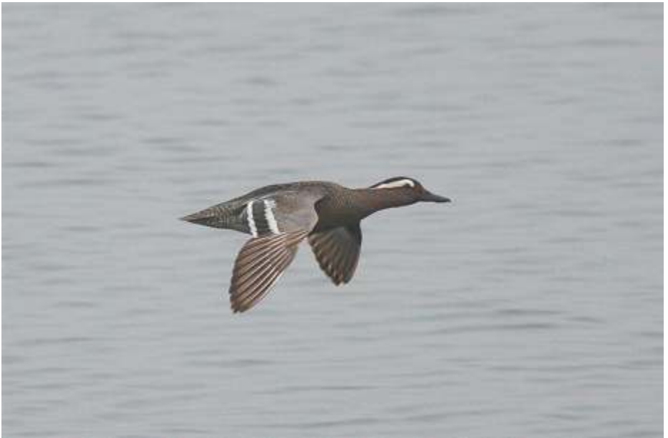
Fig 7. Garganey, Walton Res., 16 April 2011