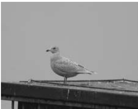
Iceland Gull, Island Barn Res., 31 Dec 2010

Kittiwake An adult flew west at the London Wetland Centre on Nov 8th.