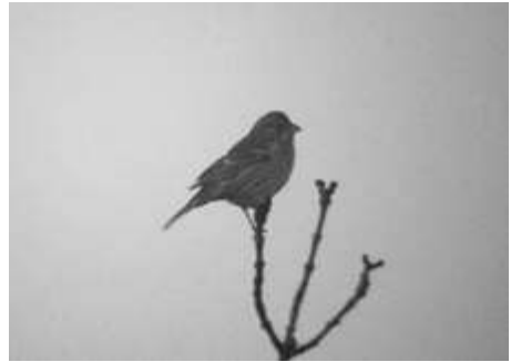
Corn Bunting, Canons Farm, Banstead, 6 Nov 2010 (David Campbell)

Corn Bunting One was at Canon's Farm, Banstead on Nov 6th.