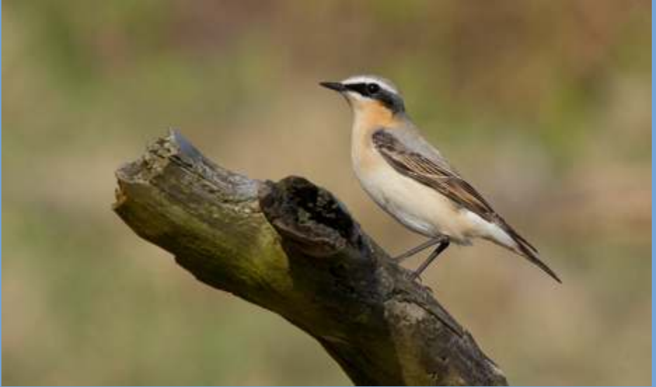
Fig 8. Wheatear, Pirbright Common, 22 April 2011 (Kevin Smith)