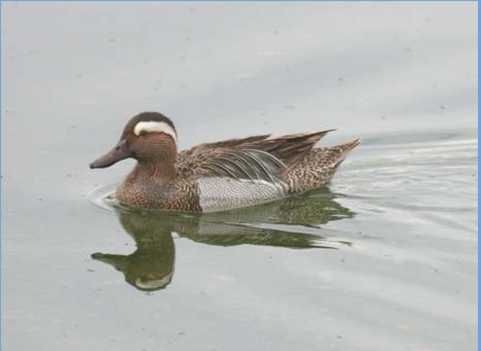
Fig 9. Drake Garganey, Walton Res, 15 Apr 2011