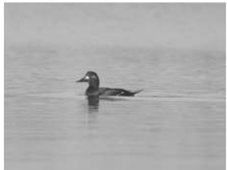
Velvet Scoter, Island Barn Res., 19 Nov 2010

Velvet Scoter A female/immature was at Island Barn Res from Nov