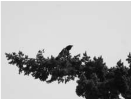
Raven, near Thorncombe, 1 May 2011