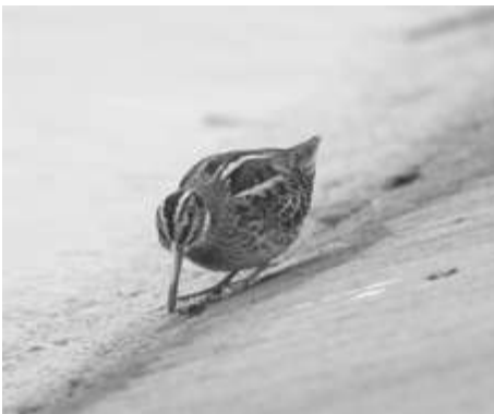
Jack Snipe, QE2 Res., 23 Dec 2010 (Dave Harris)

Jack Snipe The first were at Beddington SF on Sep 26th. Wintering birds were reported from Beddington SF (up to 4), the London Wetland Centre (up to 3), QE2 Res (2 feeding in the cracks of the reservoir basin on Dec 23rd), Tice's Meadows, Badshot Lea (1) and Wimbledon Common (1).