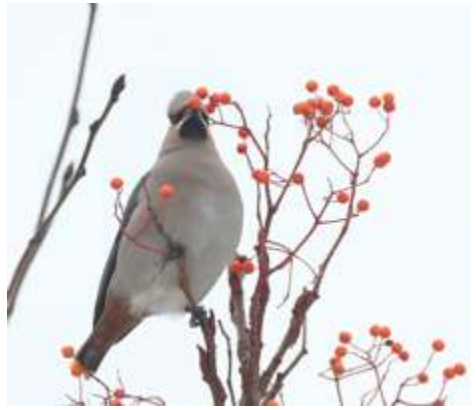
Figs 3 & 4 Waxwing, Molesey 2 Dec 2010 (Dave Harris)