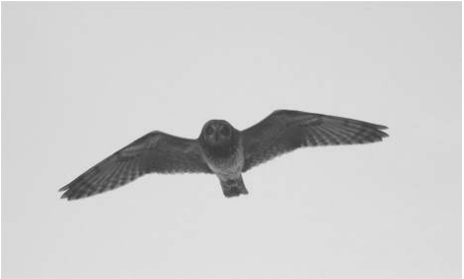
Short-eared Owl, QE2 Res., 19 Nov 2010