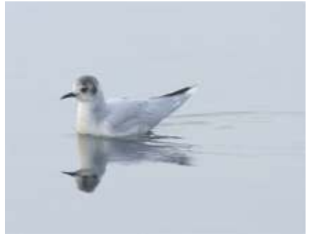
Figs 1 & 2, Little Gull, Island Barn Res, 4 Dec 2010