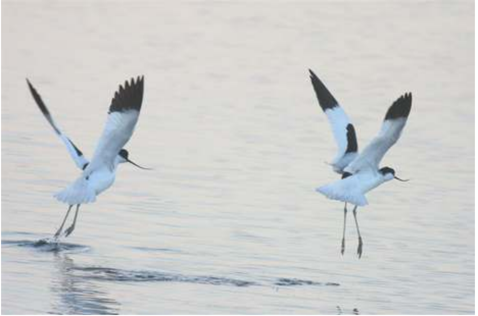
Fig 6. Avocets, QE2 Res, 8 March 2011