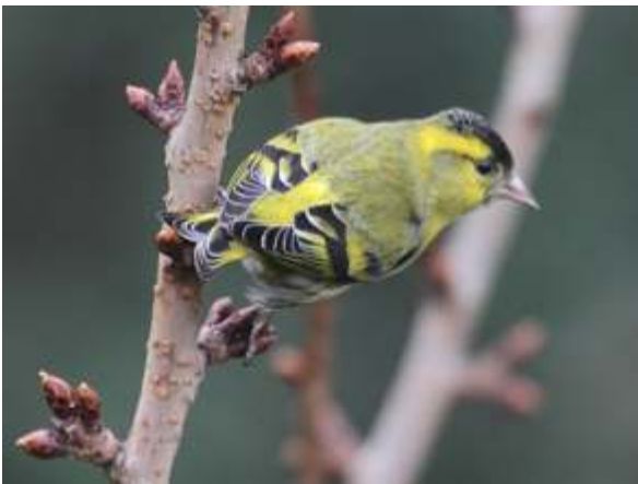
Fig 5. Siskin, Horley 16 Mar 2010 (Derek Washington)